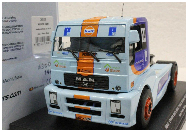
Fly MAN TR1400 Smolensk Gulf Truck Grand Prix 2010 #14

Length 165mm Height 75mm Wheelbase 107mm Front/Rear Track 70mm Weight 147g Magnet Yes Motor Long-Can mounted Inline Axle & Gears - 2.48mm Drivetrain 2WD Pinion/Gear 9/27 Front Hubs Plastic Rear Hubs Plastic