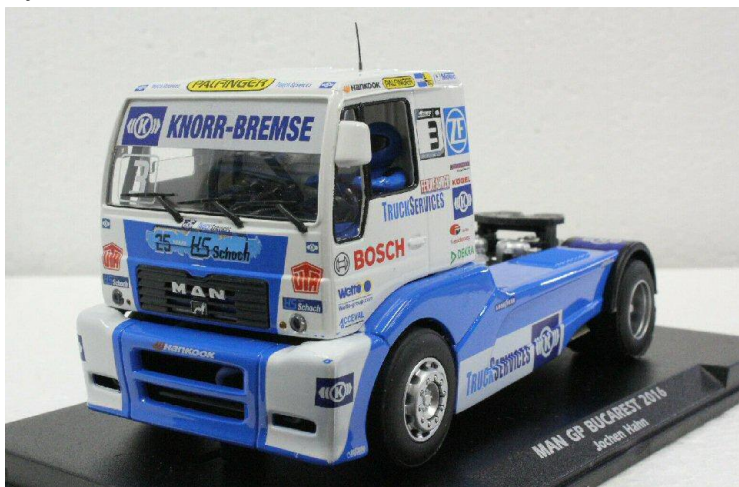
Fly MAN TR1400 G.P. Bucarest 2016, #3 Scale ~ 1:35